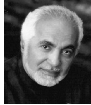
Mediterranean Award for Interreligious Dialogue to Imam

Since 1995 she has been working for dialogue and peace process in the Euro-Mediterranean region. Being one of the promoters of the "Barcelona Process". she has made every effort in concrete partnership initiatives involving the European Union and the Countries of the Mediterranean, developing operational programmes which, in spite of all difficulties, have had an influence on mutual understanding and exchanges among the peoples of the two shores.