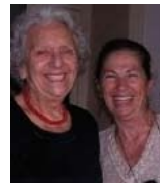
Mediterranean Award for Social Solidarity to

Former First Ambassador of Israel to the Holy See, a highly refined intellectual and ardent supporter of dialogue among peoples and different cultures, whose diplomacy and above all motivation as a man of peace represented a historical step forward in the normalization of diplomatic relations between the State of Israel and the Vatican State and, more generally, in the improvement of diplomatic relations between Jews and Catholics after the tragedy of the Shoah.