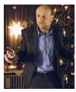
Mediterranean Award for Cinema to

For his contribution to the spreading of the value of culture and music as a fundamental instrument for dialogue, cooperation and solidarity among