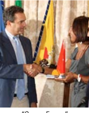
"Special Edition" Luigi de Magistris Mayor of Naples (ITALY)