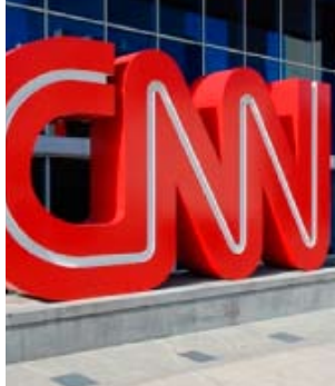
Mediterranean Award for Media to CNN

For their immediate and impassioned availability to support Mediterraid project through technological skills and communication abilities, so that it becomes a connection language with the Italian cultural world thanks to RAI web portal. Rai Nuovi Media confirms the central role of the public broadcasting service even in the context of new digital media through a strategy of communication subsidiarity which enables any subject to be protagonist of its own messages both in the national and international field.